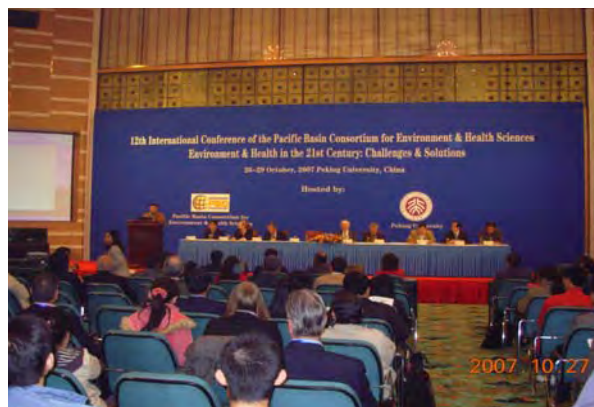
Nearly 200 people from more than 20 countries attended the three day meeting.

presentations from the conference are available upon request. Proceedings of the meeting will be published in the near future as a collection of individual articles in a volume of The Annals of the New York Academy of Sciences .